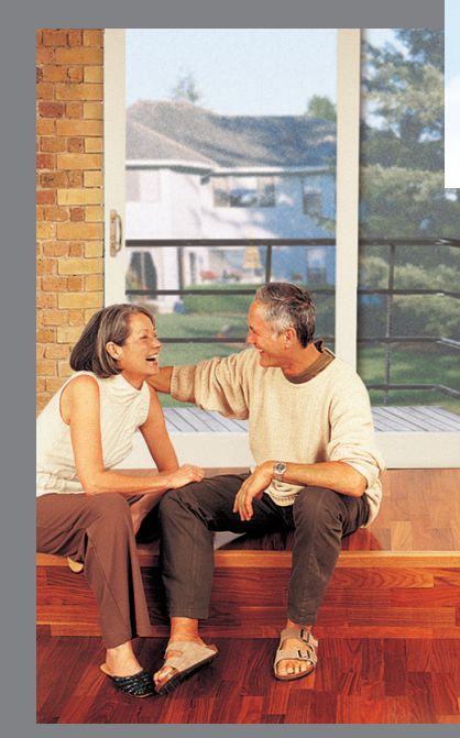
Broaden your view and open your home with ECOtru new construction patio door. They'll give you a brilliant new perspective and a custom design to your home.